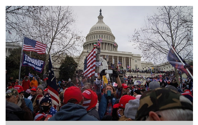
Domestic terrorists storm the U.S. Capital on January 6,

There has been a discussion recently about how we should not challenge, even in symbolism, as it may offend. Perhaps I should not, for instance as a gay man, wear clothes or symbols laying out my views on sexuality, but I honestly think this would be a step in the wrong direction. There seems a fear to offend the very groups which caused the inequality in the first place! Here, morality and ethics are central to what we do. Should we accept the definitions given us as children or do we challenge and enable change? One argument, supposedly within the draft decision of this present Supreme Court issue, is that the promulgators of the US Constitution gave no rights to women on reproductive issues. Actually, as a historian with interest in constitutional history, I can say honestly that the framers of the constitution had no interest in women at all. Women had practically no rights and nor did men who did not fit a tight social group in the 18th Century. So, do we always look back or do we look forward? My opinion is that we need to see the world as it is and deal with inequalities now rather than hike on about docu- ments written long ago in a different world. This applies to every country and not just to America.