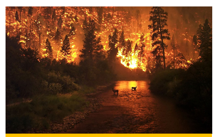
Wildfire in Bitterroot National Forest, Montana taken by the U.S. Department of Agriculture. Image is in public domain .

Next was Climate Change. Wildfires raged. Floods and landslides occurred. The Earth heated and glaciers melted, all at a rate not seen before. Droughts in Africa, which formerly happened every 6 years, now happen every three. Starvation and displacement are the results which, again, fuel bigotry and fear in others. For Pagans, the wellbeing of Mother Earth is central to our belief structure. If we do not cherish this planet and all life upon it, we fail in our worship of whatever deity we choose to believe in. It is inherent within us not to turn a blind eye to the degradation and murder of nature and our environment. However, Covid and conflict has given excuses to most to do just that. It prompts the repeated diversion into things that cause us to forget. It causes the total madness of misplaced priorities. To show what I mean, consider the payment of $49 Billion for one man to buy one chat platform. This is an unimaginable amount of money to a person sometimes on $1 wage a week or even a month. This sum would enable a lasting change to world hunger and poverty. And yet this 'person' (and I use the term advisably as