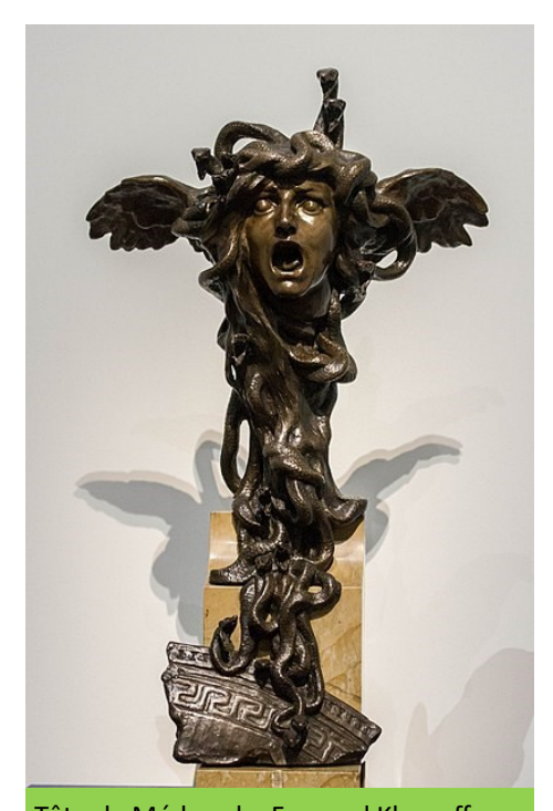
Tête de Méduse by Fernand Khnopff .

If the disconnection is too great, tragedy of the inevitable becomes our collective hubris.